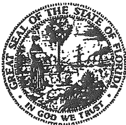
Jim Smith Secretary of State

Authentication Code: 894A00001635-011494-N94000000208-1/1